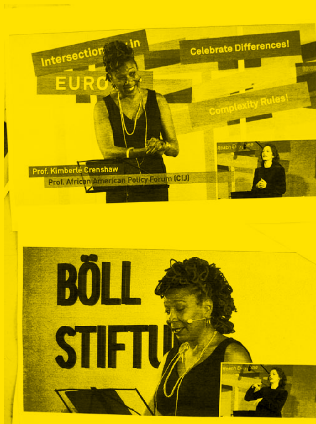
Sunday, 28th of April 2019, 7 pm - 11 pm at Heinrich-Böll-Stiftung: Excursion to the Feminist Gala for and with Prof. Kimberlé Crenshaw “Happy Birthday, Intersectionality!”